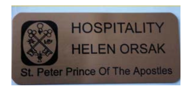
The Art of Hospitality